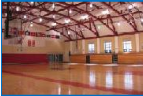
Before: 400W MH