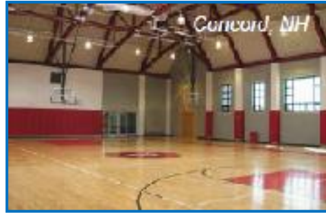
After: 210W MasterColor Elite