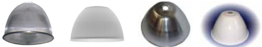
Acrylic Refractor & Conical Lens