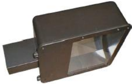
Shown with Pole Mount

Uses Proven Philips MasterColor® CDM Elite