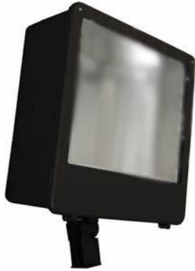
Shown with Pole Mount