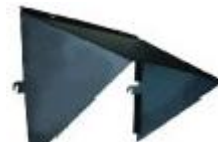
Wire Guard Accessory