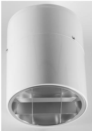
55W Induction 100-120V, 200-277V