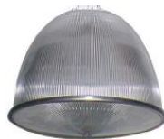
Acrylic Refractor & Conical Lens