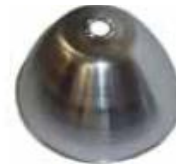
Aluminum with Hammer Tone Finish