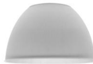
Micro Cellular Formed Refractor