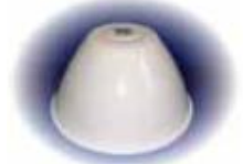
Powder Coated Aluminum