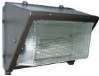
55W Induction 100-120V, 200-277V