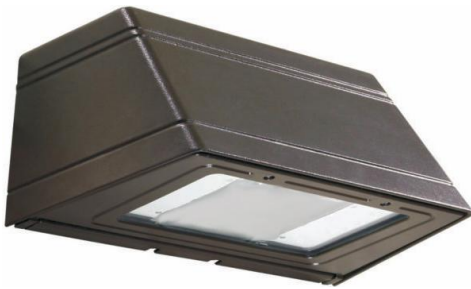
55W Induction 100-120V or 200-277V