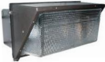
181013 Model Shown

55W Induction 100-120V, 200-277V 85W Induction 100-120V, 200-277V 165W Induction 100-120V, 200-277V