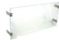
Vandal Shield (optional)

Part Number Example: PLEDCWP/2200/850/120-277