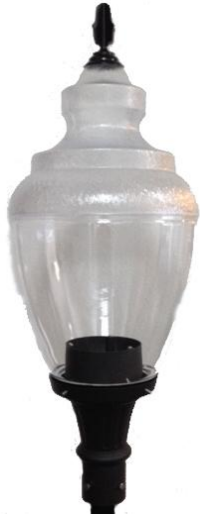
(Shown with H1 and Laurel globe)