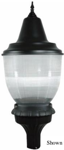
Shown with F1, H2 and Spun Aluminum Top