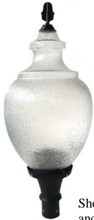
Shown with H1 housing and Maria Globe