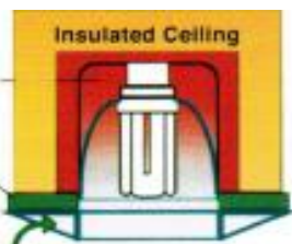
Ballast in cool zone